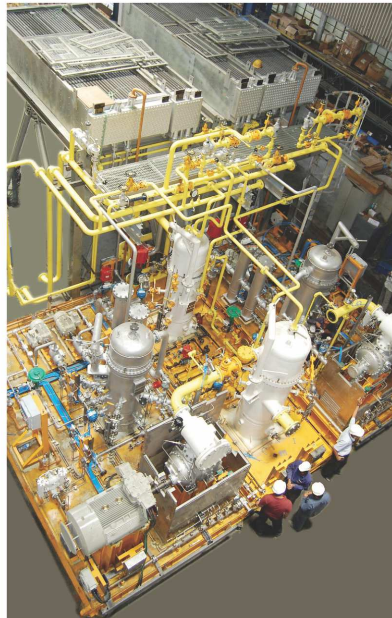
Gas Compressor Pkg. - Offshore platform, ONGC MHN