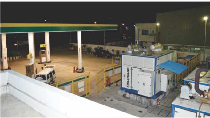
MNGL, Pune (Various type - 750, 1200 SCMh - Motor Driven, Gas Engine Driven)