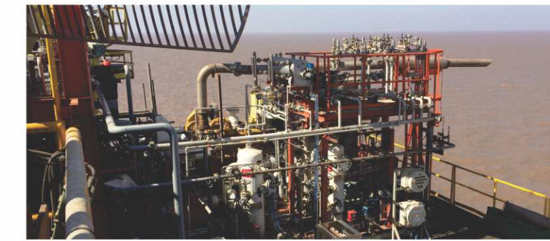
Gas Engine driven, Reciprocating Gas Compressor Package on Unmanned Offshore Platform.