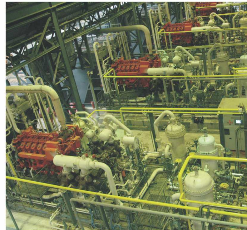
Gas Compressor Pkg., ONGC, Nazira