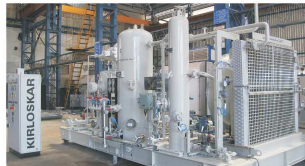
Upstream Gas Booster Package for Adani Gas