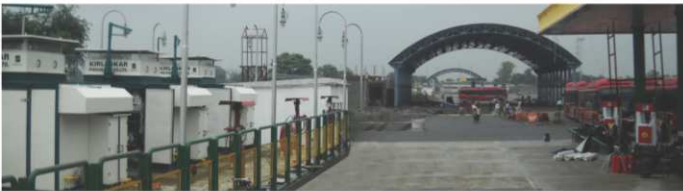
IGL Millennium Park, New Delhi (6 Packages - one of the largest fleet of NGV Passenger buses in the world)