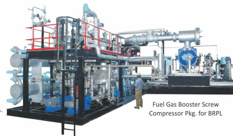
Fuel Gas Booster Screw Compressor Pkg. for BRPL