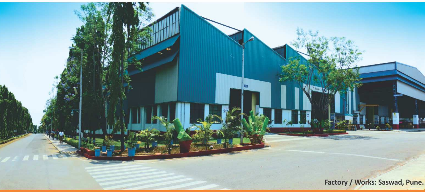
Factory / Works: Saswad, Pune.