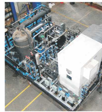
PSA Tail Gas Compressor Pkg. - BCPL