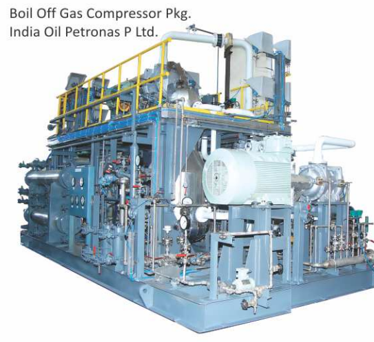
Boil Off Gas Compressor Pkg. India Oil Petronas P Ltd.