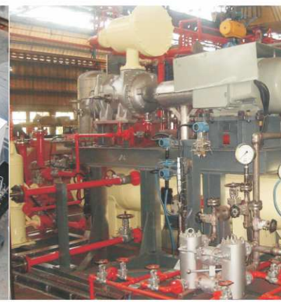
Psa-Tail Gas Compressor Pkg. - IOCL Panipat