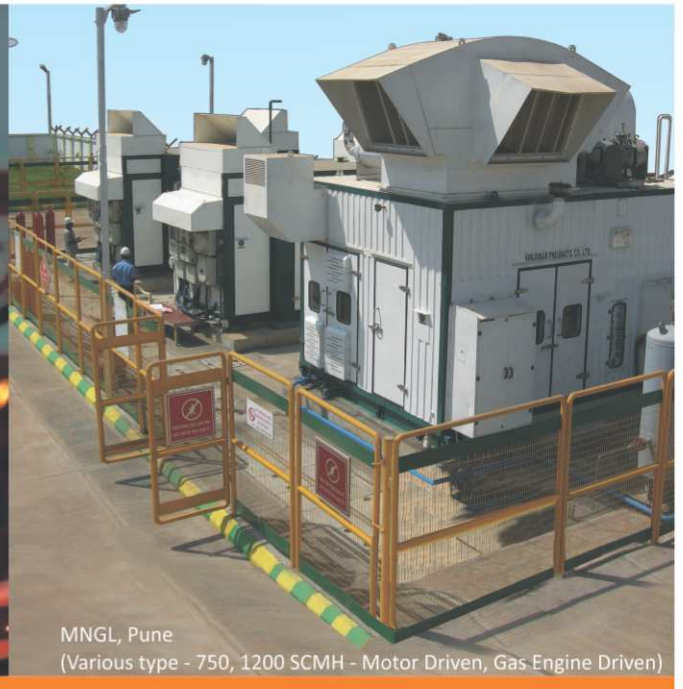
MNGL, Pune (Various type - 750, 1200 SCMh - Motor Driven, Gas Engine Driven)