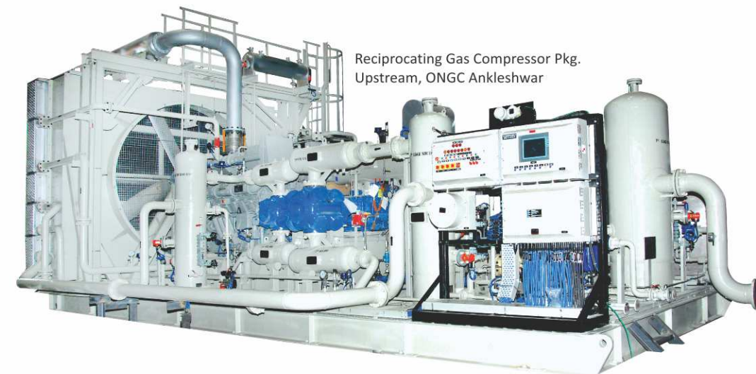
Reciprocating Gas Compressor Pkg. Upstream, ONGC Ankleshwar