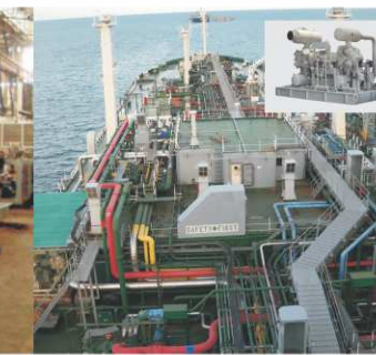
Compressor Pkg. on FPSO LPG Petrostar, Indonesia