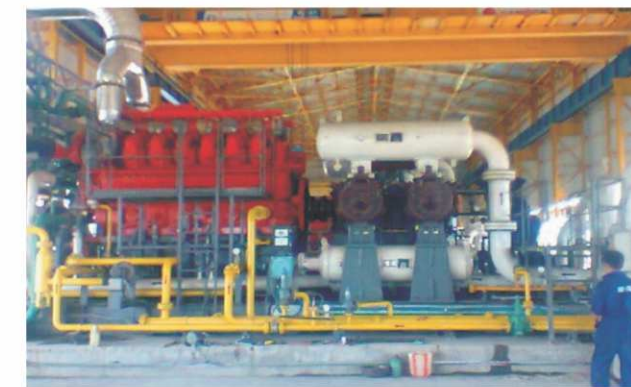
Natural Gas Transmission Compr. Pkg.