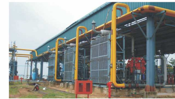
CBM Screw Pkg.