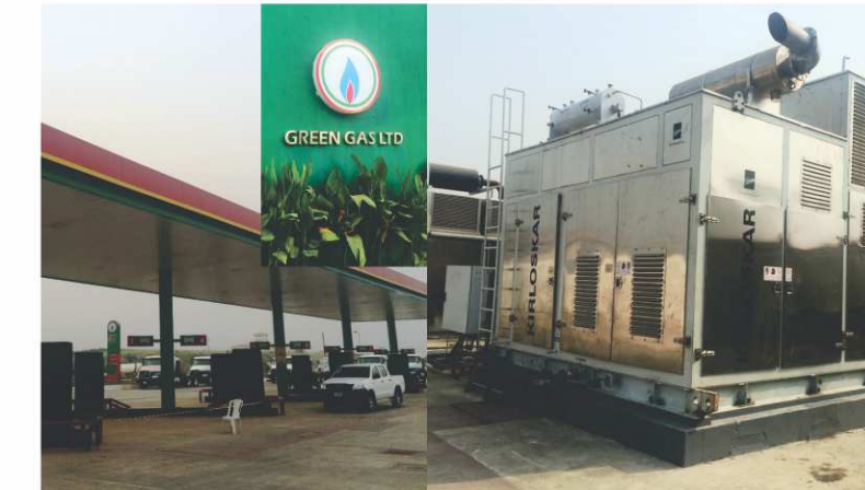
CNG Package for NGV Station - Green Gas Ltd ( Nipco PLC ), Nigeria