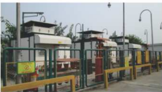
BGL, Hyderabad (1900 SCMh)