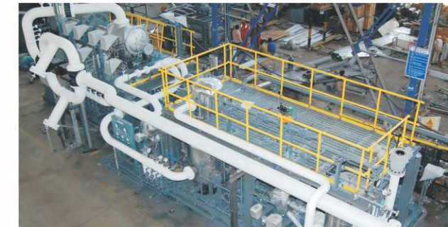
IPPI Ennore Flash Gas Compressor