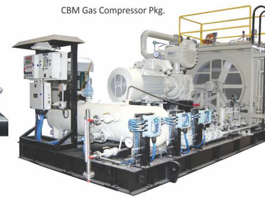
CBM Gas Compressor Pkg.