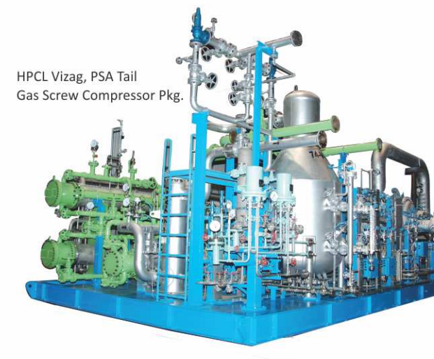
HPCL Vizag, PSA Tail Gas Screw Compressor Pkg.