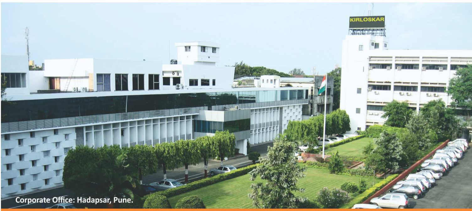
Corporate Office: Hadapsar, Pune.