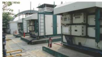
IGL, Delhi (2400 SCMh)