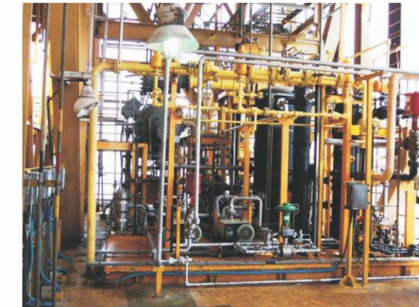
Offshore Platform Flare Gas Recovery Pkg. - ONGC Neelam Hira