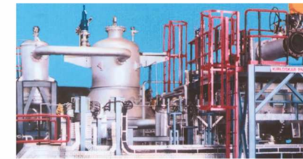
Flare Gas Recovery Unit- Zero Flare Project Oil & Natural Gas Corporation Ltd., Uran