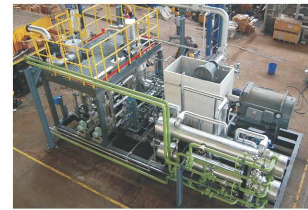
MRPL Gas Booster Pkg.