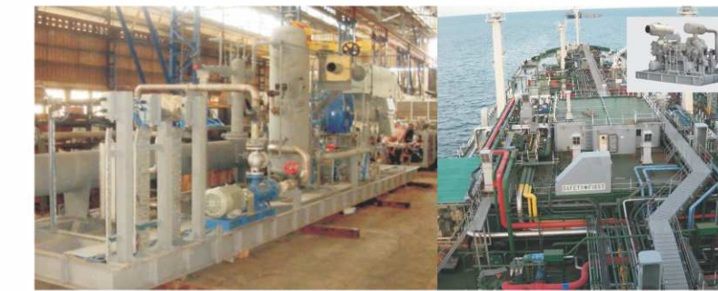
Ammonia Unloading & Holding Refrigeration System Green Dome Petrochemicals, Sharjah