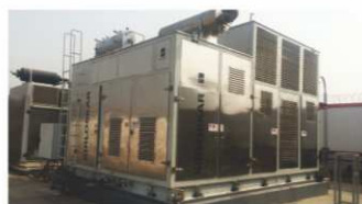
NIPCO PLC, Nigeria (3500 SCMh- Gas Engine Driven)