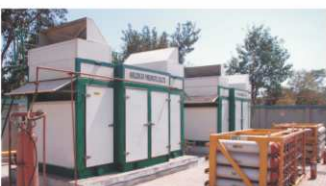
Adani, Chandola (Various type - 750, 1200 SCMh Motor Driven, Gas Engine Driven)