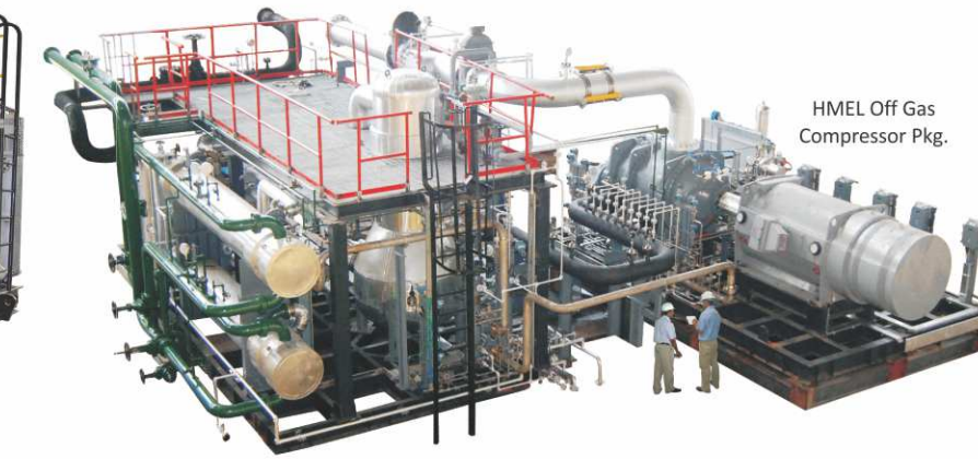
HMEL Off Gas Compressor Pkg.